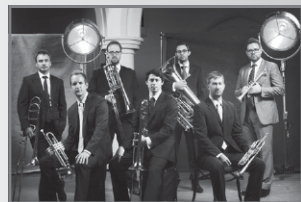
Septura February 17