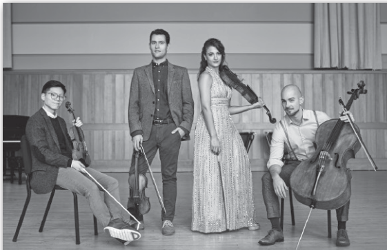
Eroica Trio September 30